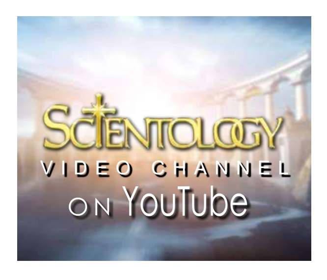
Copyright © 2008 The Telegraph. All rights reserved.

Disclaimer | Privacy Policy | Contact Us